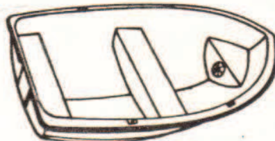
JUNIOR SAIL TRAINER

Two pairs of rowlocks and rowing positions Reinforced outboard mounting position Large, all round fender Towing eye